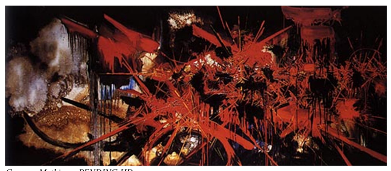
Georges Mathieu – PENDING HD Complainte silencieuse des enfants de Bogota face aux commandos de la mort, 1989 Oil on canyas . 342x152cm

Through a selection of oil paintings created between the 1940s and the 2000s, the exhibition aims to tell the story of each artist, as well as explore the strong bond they shared as a group, from the common experiences and challenges they faced and how it impacted their way of thinking, living and creating, to the intensity of their pictorial quest with the central question of figuration and abstraction.